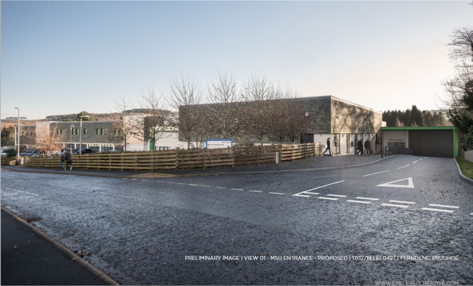
PRELIMINARY IMAGE | VIEW 01 - MSU ENTRANCE - PROPOSED | 17/12/19 | EL0497 | FERNDENE, PRUDHOE